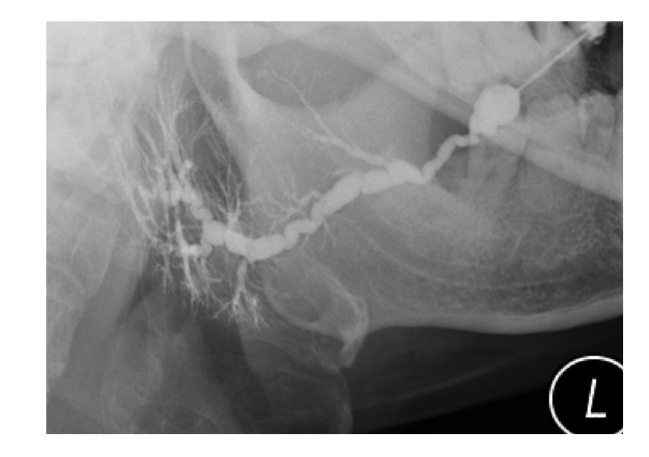
Fig. 2. Sialography of chronic obstructive parotitis (COP) demonstrating a 'sausage'-like appearance of the main duct and ectasia of the intraglandular branches (arrow).