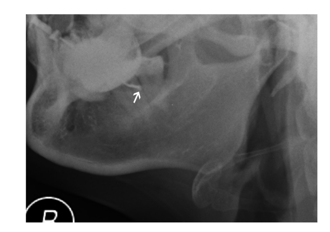
Fig. 1. Sialography of radioactive iodine-induced sialadenitis (RAIS) showing obliteration of the main duct (arrow).

Sialendoscopy was undertaken for all 93 RAIS and 94 COP glands. Endoscopy revealed that RAI-inflicted ducts had bleached ductal walls and lumen stricture in all affected glands; moreover, mucous plugs (11 glands; Fig. 5A) and debris (27 glands) were often detected. Ductal atresia was observed significantly more commonly in RAIS glands (20.4%, 19/93) (Fig. 5B) than in COP glands (0%, 0/ 94). In 11 of the 19 glands with ductal atresia, the obstructed lumen of the proximal duct was reopened after dilation of the severe stenosis. Also, four RAIS glands (4.3%) showed polypoid proliferation (Fig. 5C), which was scarcely seen in COP patients. By contrast, COP was associated more commonly with stenosis and ectasia of the main duct (Fig. 5D) (Table 1).