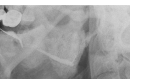
Fig. 4. Sialography of radioactive iodine-induced sialadenitis (RAIS) showing incomplete contrast filling of the main gland (arrow).